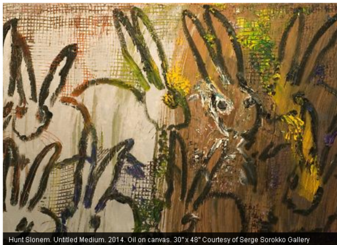
Hunt Slonem. Untitled Medium. 2014. Oil on canvas. 30" x 48"

Like 0 Share 3 Tweet 5 Pin it 2 Share 10