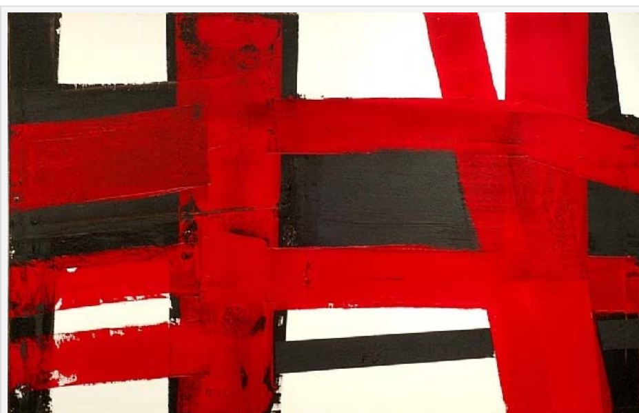
This artwork, Untitled by Jean-Pierre Rives, is currently for sale at Serge Sorokko Gallery.

The Serge Sorokko Gallery is best known for featuring paintings, sculpture, works on paper, and photography of internationally prominent artists.