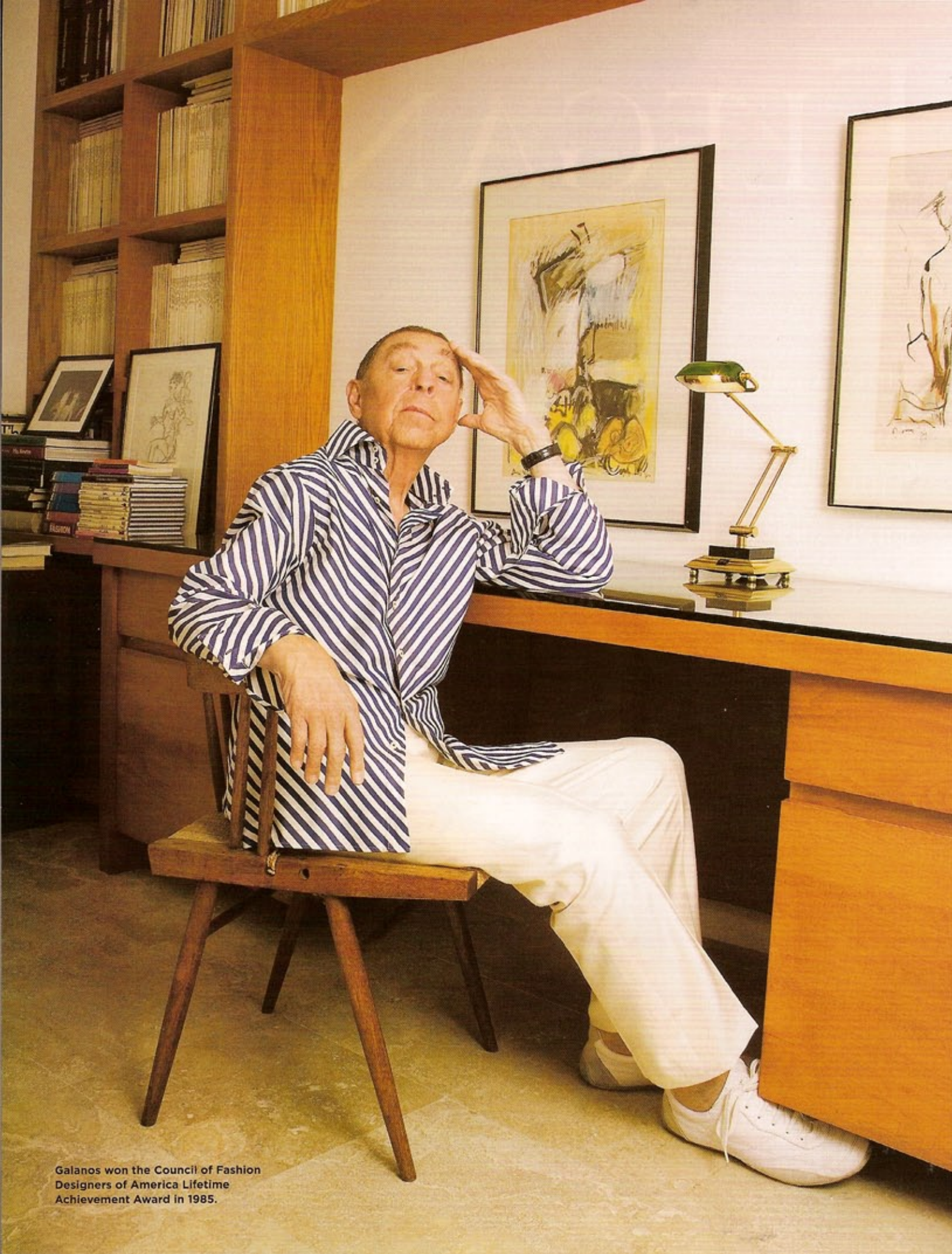
Galanos won the Council of Fashion Designers of America Lifetime Achievement Award in 1985.

Lest you think designer James Galanos — who has spent a great deal of his retirement from the pinnacle of the fashion world in 1998 here in Palm Springs — is mellowing, then you need to know this: Only this past spring he caused a ruckus.