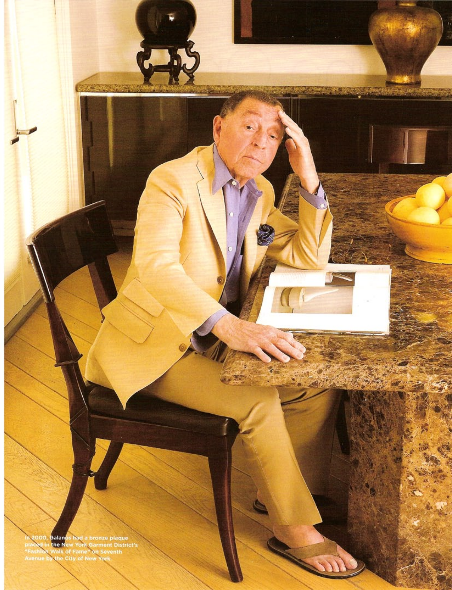
In 2000, Galanos had a bronze plaque placed in the New York Garment District's "Fashion Walk of Fame" on Seventh Avenue by the City of New York.

Online What does James Galanos have to say about working with Rosalind Russell, Nancy Reagan, Diana Ross, Marlene Dietrich, Dorothy Lamour, Judy Garland, and Ali McGraw? Point your Web browser to www.palmspringslife.com