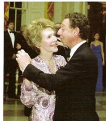
Nancy Reagan — A First Lady's Style , an exhibition at the Reagan Library through November 2008, pays tribute to the designers, including James Galanos, who helped define her style.

“I keep thinking, ...” here he pauses, editing himself and looking for the perfect word with that same laser-accurate perfection that defined his designs. “I keep hoping elegance will come around.”