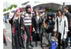
J-Pop Summit Festival