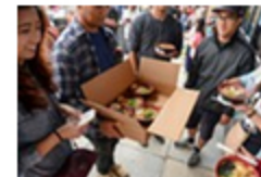
Ramen Street Festival