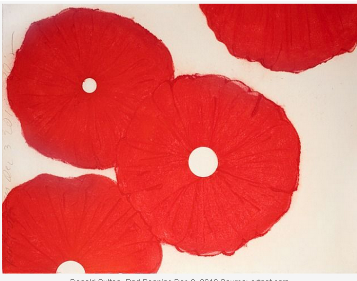
Donald Sultan, Red Poppies Dec 3, 2013

Sorokko Gallery is known for curating multidimensional and textured art that seem to come to life as you observe it. San Francisco is very lucky that the Donald Sultan exhibition has been extended to the end of July. Sultan is recognized for elevating the still-life tradition through the deconstruction of his subjects into basic forms and the use of industrial materials. This collection of over 20 original works includes an unveiling of new paintings and classics from the past decade, and marks the first time Sultan has shown in San Francisco in over 20 years.