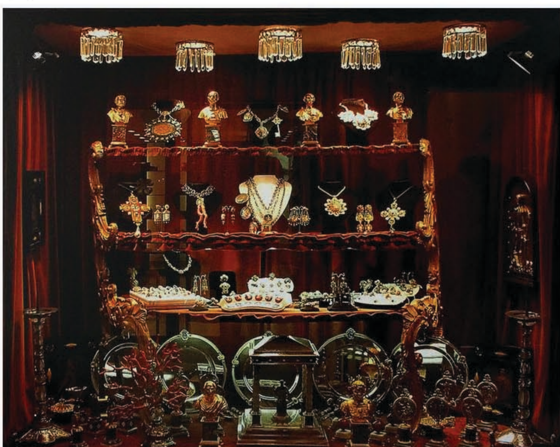
The Codognato boutique in Venice.

BY KATIE SWEENEY | HAUTE JEWELS, NEWS | DECEMBER 8, 2016